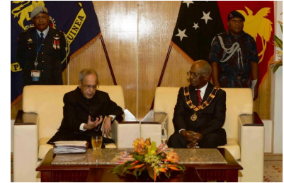
President meets G.G. Sir Michael Ogio

President Shri Pranab Mukherjee paid a State Visit to Papua New Guinea (PNG) on April 28-29, 2016. He met Governor General Sir Michael Ogio on 28th April. The leaders exchanged views on bilateral, regional and multilateral issues of mutual interest. They condemned terrorism and called upon the states to reject the use of terrorism as an instrument of state policy and agreed to strengthen cooperation in multilateral fora in combating terrorism.