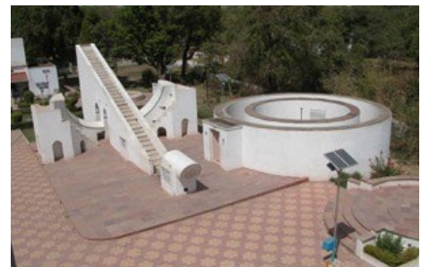
Veda Shala (Observatory)