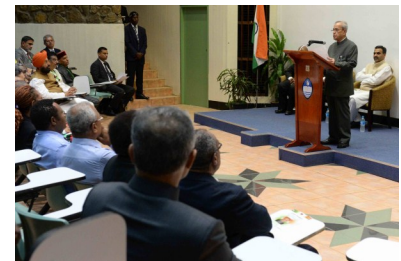
President addresses PNG University

Both leaders expressed confidence that PNG with its abundant natural resources and India with its managerial and technical expertise present complementarities which could be built upon for the mutual benefit of the two countries. They agreed to enhance bilateral cooperation in economic, security, defence, education and health sectors. Governor General reiterated his Government's support for India's candidature for permanent membership of the United Nations Security Council. PNG announced the facility of visa on arrival for Indian tourists and welcomed India's offer of a coastal surveillance radar system and coast guard patrol vessels. PNG agreed to develop new avenues of cooperation with India in exploration and development of its vast oil and gas resources. President Mukherjee announced that India would provide retro-viral drugs and equipment for the treatment of 20,000 HIV patients in PNG for one year.